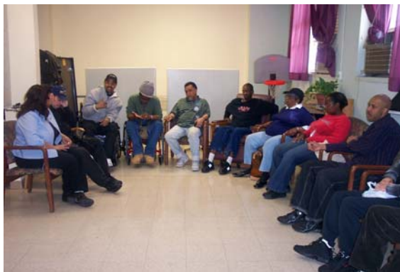
The weekly discussion group at ADHC gives registrants a chance to make a difference in the lives of their fellow registrants by sharing knowledge and experiences.

tive groups at the program, which are facilitated and assisted by a staff member. The registrants tap into their